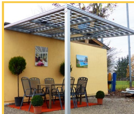
Example picture, size and number of modules may vary depending on the model