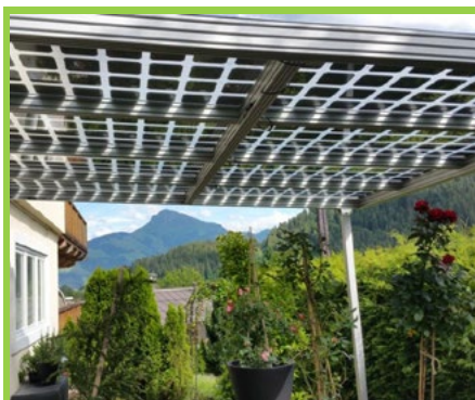
Example picture, size and number of modules may vary depending on the model