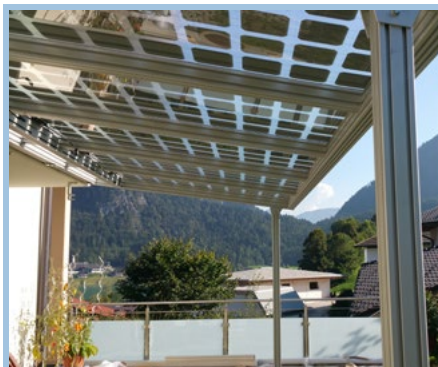
Example picture, size and number of modules may vary depending on the model