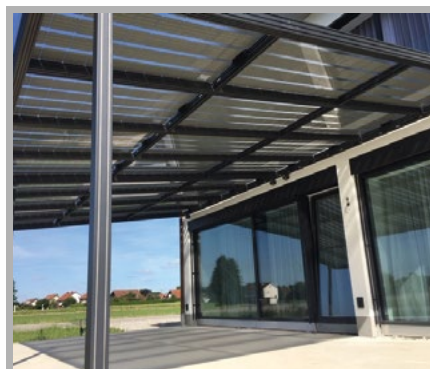
Example picture, size and number of modules may vary depending on the model