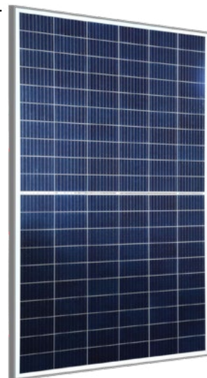
SR-M60-HC (330-345 W)

It will be available in the power classes 360 and 365 Wp from end of May at a particularly favourable introductory price. Orders can be placed immediately at the prices shown in our price list.